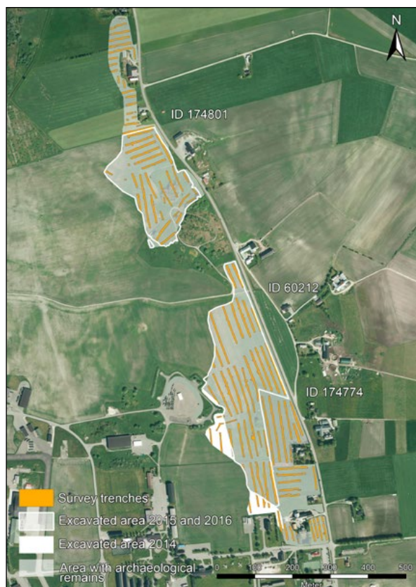
Figure 4. Survey trenches from 2013 (Haugen, Sjøbakk & Stomsvik 2014), defining protected area with Iron Age and early medieval settlement traces (ID 174774, 60212, and 174801). Parts of the protected area were excavated in 2014, 2015 and 2016. Survey trenches extended throughout the planned area of the airfield (Figure 3). Illustration: Magnar Mojaren Gran, NTNU University Museum.