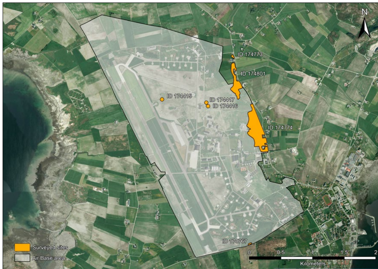
Figure 3. Overview of the Ørland airfield planning area and sites with mainly Iron Age settlement remains under cultivated land, surveyed by Sør-Trøndelag County Council in 2013 (Haugen, Sjøbakk & Stomsvik 2014). Illustration: Magnar Mojaren Gran, NTNU University Museum.

and 4). The survey revealed that relatively dense Iron Age settlement traces were located along the central ridge running through Ørland from north to south, approximately 11m above the present day sea level. A large part of the surveyed archaeological remains were found within the planned extension area of the air base at Vik (Haugen, Sjøbakk & Stomsvik 2014).