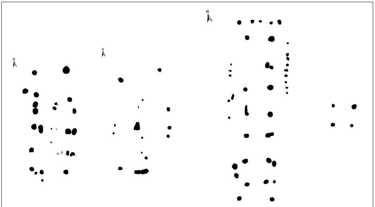
Figure 1.1 From the left: examples of one-, two- and three-aisled buildings and a four-post structure. Drawn by Jan Kristian Hellan.

There are also three-aisled buildings which had other primary functions than the combination of house and stalls. These are usually referred to as ‘economic buildings’. It is often difficult to distinguish houses from economic buildings in the archaeological record in cases where specific functions — for instance as a smithy — cannot be linked to the building (Carlie and Artursson 2005:164). Interpretations of the spatial divisions of the multifunctional building and their role are based to a great extent on well-preserved examples in Jutland and northern Germany. With less well-preserved evidence it is harder to distinguish between economic