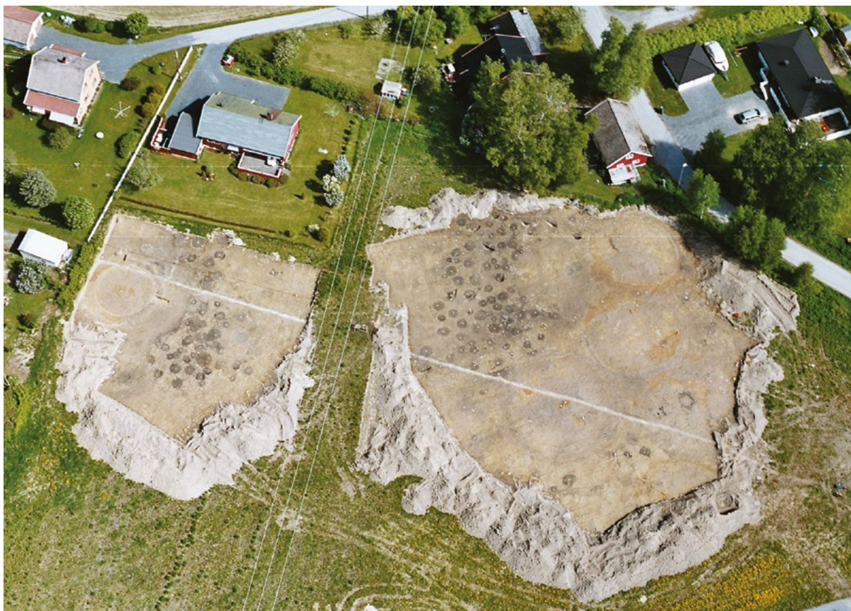
Figure 2. Foss nordre in Sørum, Akershus; an open air cooking pit site surrounded by gravemounds that are now damaged by ploughing.

to the mid-5 th -century AD. Sporadic use is documented in the Merovingian and early Viking Age. More than 50 % of the pits contained cattle teeth, unburned animal bones or a combination of these finds (Derrick 2012). Supported by the finds from Guåker, Stange, Hedmark (Bukkemoen 2010) presented below, it seems rather likely that at least for the large sites the cooking pits' main purpose is food preparation and consumption.