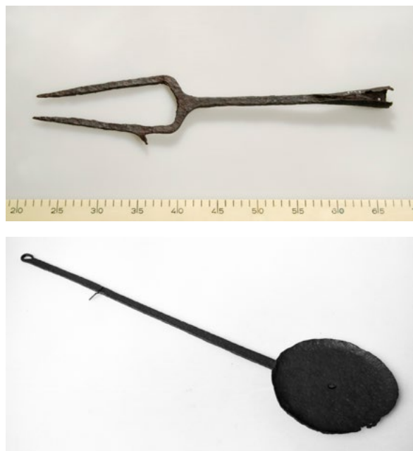
Figure 3. Iron roasting spit from Liltvedt in Hurum, Buskerud (C409). Iron frying pan from Aakeren in Tokke, Telemark (C1757).

Different types of vessels made of iron or soapstone represent the most noticeable changes in cooking utensils as they seem to replace pottery as the main utensils for every day cooking (Petersen 1951; Skjølsvold 1961; Rabben 2002; Baug 2015). However, different types of frying equipment also turn up in graves in this period, although in relatively small numbers. From both literary and archaeological