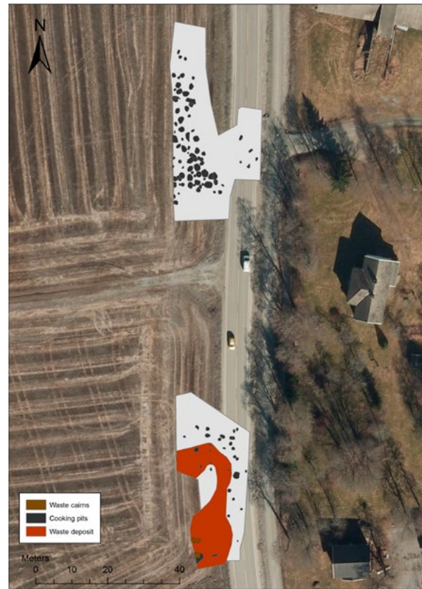
Figure 4. The site at Guåker in Stange, Hedmark.